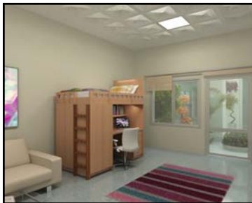
3D sample drawing of a boarding room at the new Taner Hall