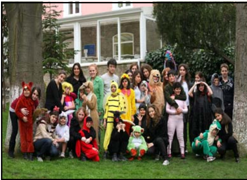
The Social Service Club with friends from the Hasan Tan Orphanage

This year our Social Service club realized a photography and book project related to the Hasan Tan Orphanage in Üsküdar. 18 orphans were invited to our campus. They each wore a different animal costume and their photos were taken by a professional photographer. Each child wrote a story and drew the picture of the animal whose