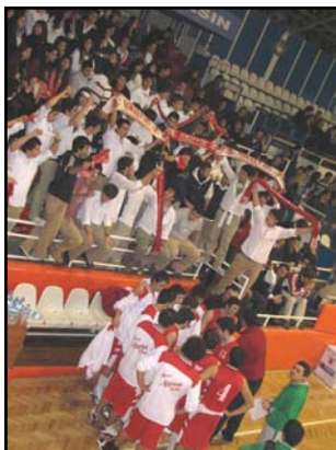
TAC at the basketball finals in Mersin