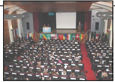
TIMUN conference in Istanbul at ÜAA

ÜAA hosted the 15th annual session of the Turkish International Model United Nations (TIMUN) conference in November. 400 students from 45 different schools attended the conference. There were 21 schools attending from outside Turkey. They came from the following countries: Egypt, France, Germany, Greece, Israel, Italy, Kuwait, Netherlands, Saudi Arabia, Sweden and Switzerland. There were 24 schools from Ankara, Gebze, Istanbul, Izmir and Tarsus. This year we received good press coverage with a whole page devoted to TIMUN in the Turkish Daily News. This event continues to be the premier Model United Nations event in Turkey. Our MUN club has also participated in the following conferences: DSAMUN (Athens, Greece), THIMUN (Hague), ACMUN (Thessaloniki, Greece), MUNESCO – Ankara, Haarlem MUN (Holland), and RCIMUN (Robert College).